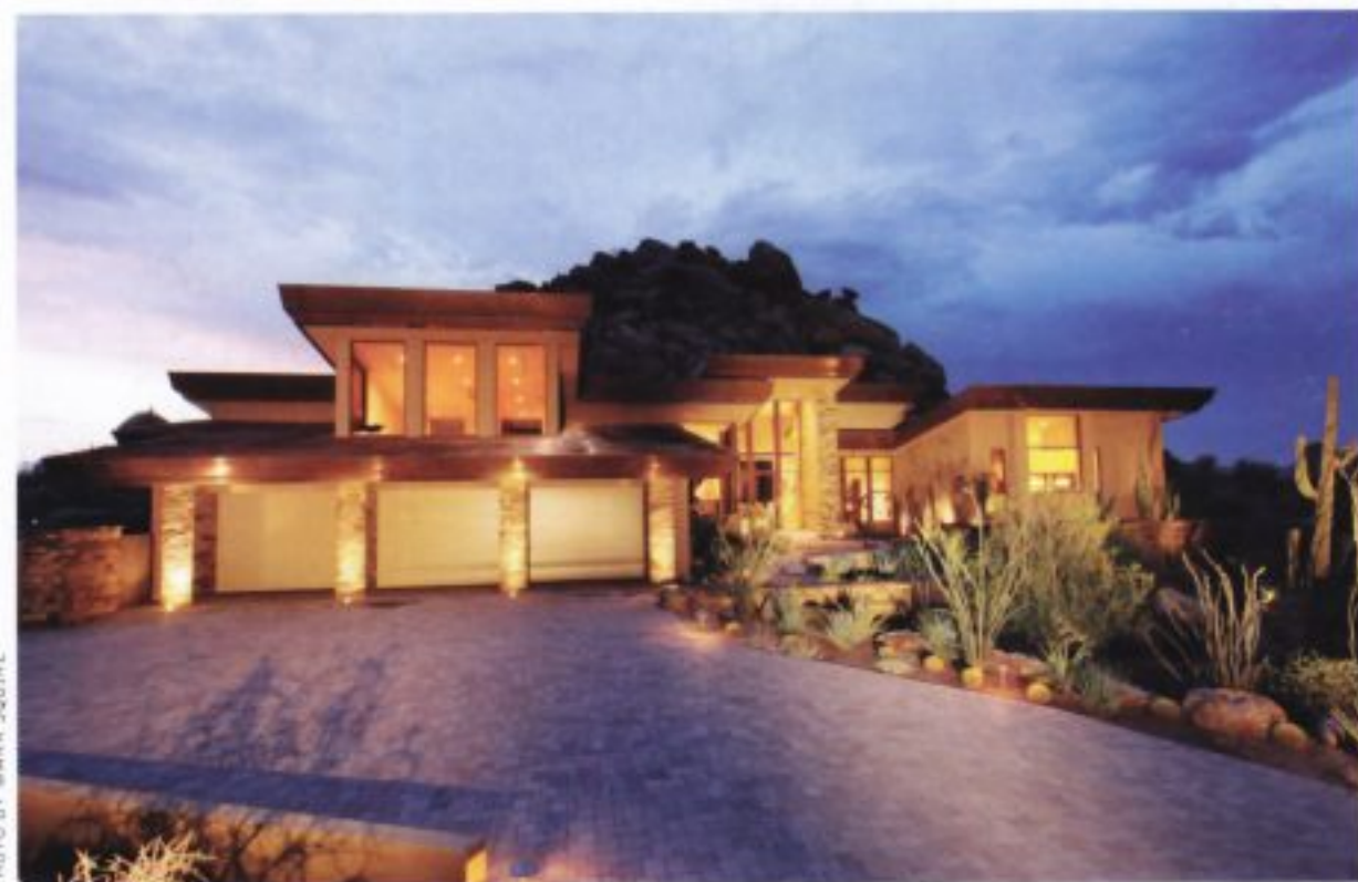
The butterfly roof geometry of this house mimics its site while allowing for incredible views and abundant natural light throughout.

For more information about Sever Design Group Architects, please call (480) 596-0040 or visit www.severgroup.com . ■