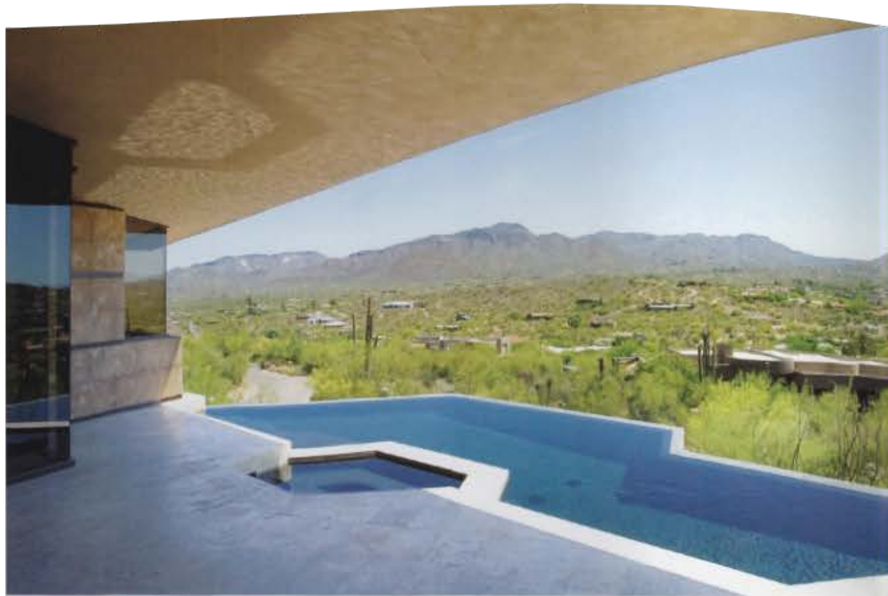
THIS CRYSTAL-CLEAR, NEGATIVE-EDGE POOL SEEMS TO HANG IN SPACE OVER THE TOWN OF CAREFREE.